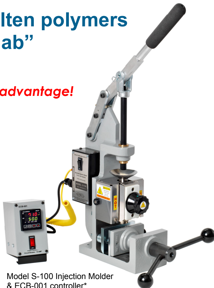
Model S-100 Injection Molder & ECB-001 controller*