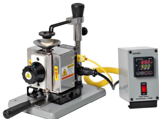
Model M-100 mixing device & ECB-001 controller*